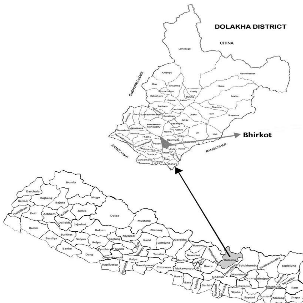
Map 1: Location of Dolakha and Bhirkot in Map

Dolakha, a mountainous districts lies about 132 Km North-East of Kathmandu—the Capital of Nepal (see map 1). District's altitude varies from 732 m.asl (Siteli) in rgw south to 7148 m.asl (Gaurisankhar) in the North. The district mostly consists of south facing slopes with some flat valley floors.